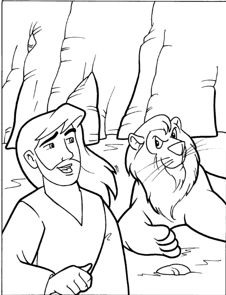
Daniel in the Lions' Den