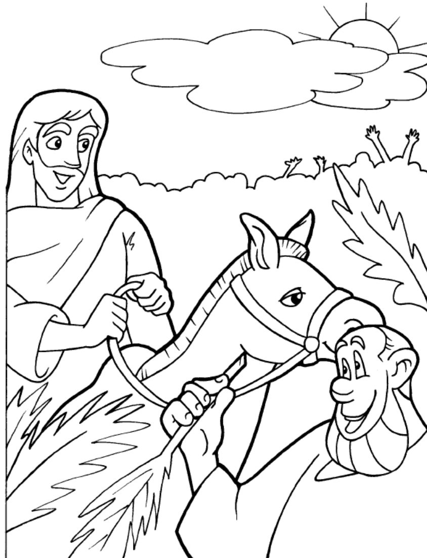
The Triumphal Entry