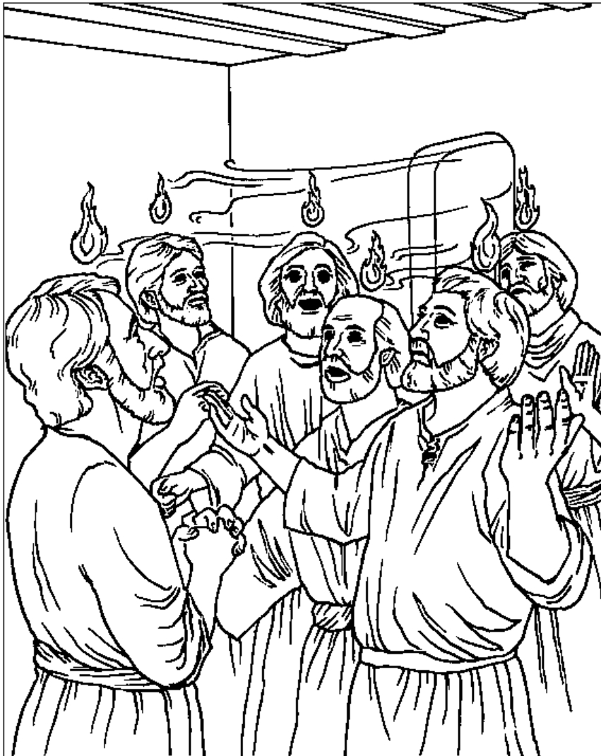
The Day of Pentecost Acts 2