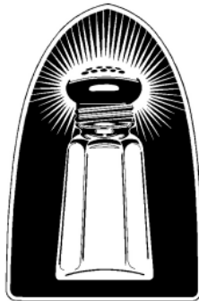
CALLED TO BE SALT

Copyright © Sermons4Kids, Inc. May be reproduced for Ministry Use