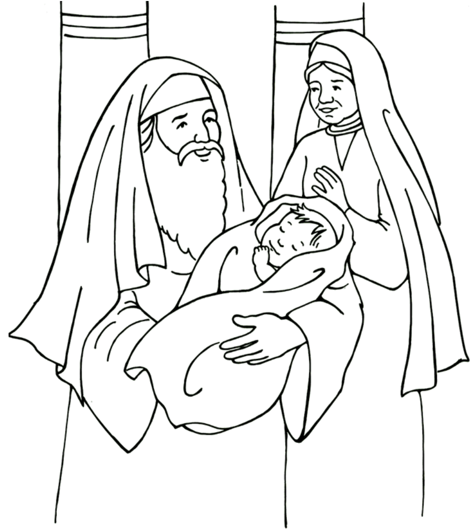
Simeon and Anna Thank God Luke 2